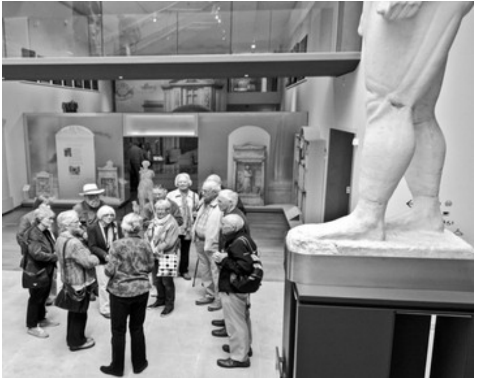
“One of our groups with a guide”