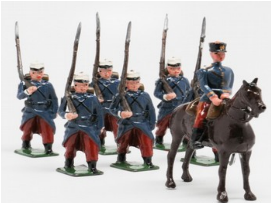
The Foreign Legion