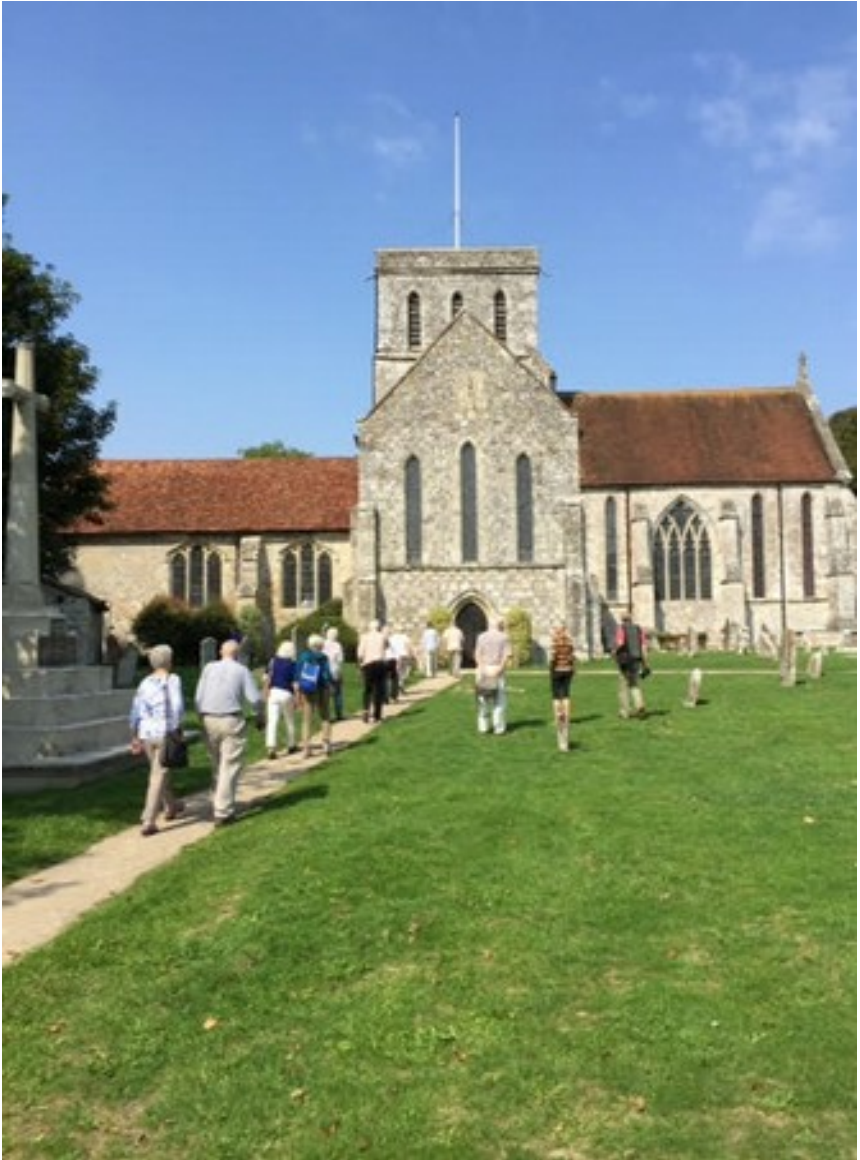
Abbey Church of St. Mary and St. Melor