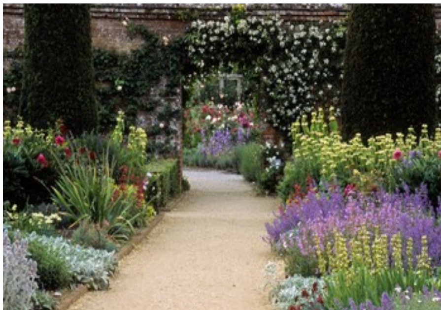
Mottisfont: the rose garden