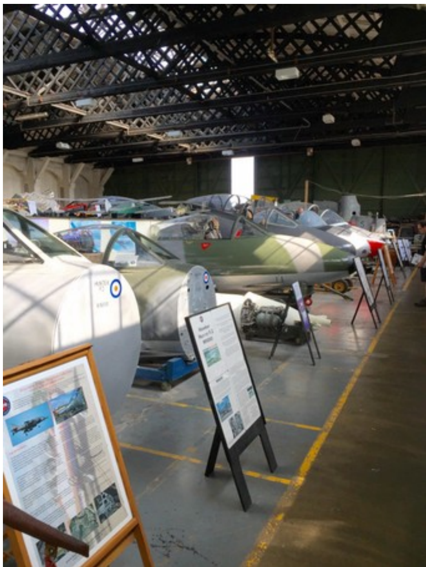
Boscombe Down Aviation Centre